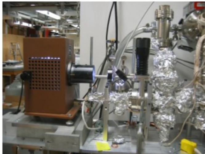
Figure 2 - Experimental Setup

destruction rate is calculated by monitoring the rate of pressure increase in the sample cell. The sample is illuminated for \sim 24 hrs—at which point the production rate of photolytic products is below background levels.