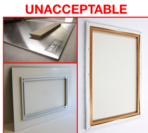
Pieces with unacceptable mounts will be rejected.

Smaller than 8.5"x11", less than 3 lbs pieces that can be hung on a single thumbtack are acceptable as is. Artists are welcome to provide personal easels for large or heavy pieces, though we reserve the right to display them however we see appropriate. Prints, photographs, drawings,