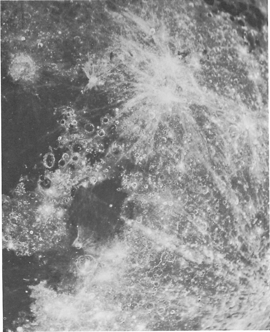
Fig. 2 Rectified view of the southern Mare Fecunditatis area showing the extensive ray systems associated with the small craters Furnerius A (right member of pair) and Stevinus A (left member of pair). The crater Rosse and its associated Tycho ray can be seen in Mare Nectaris (above and left of center).